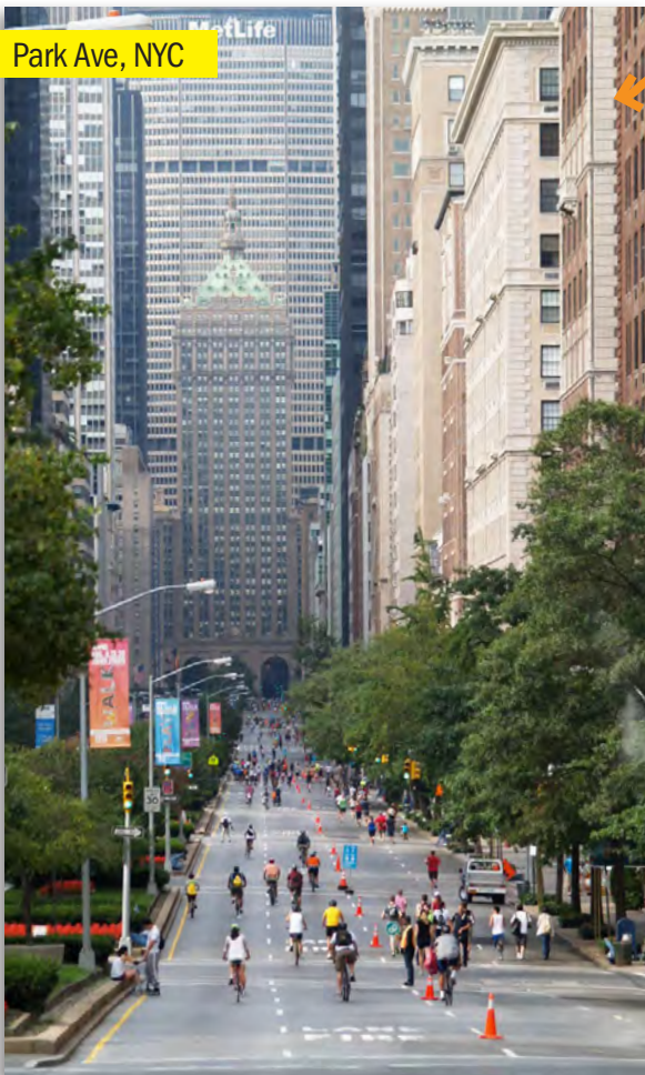
Park Ave, NYC

... they have one in New York and it attracts 300,000+ people